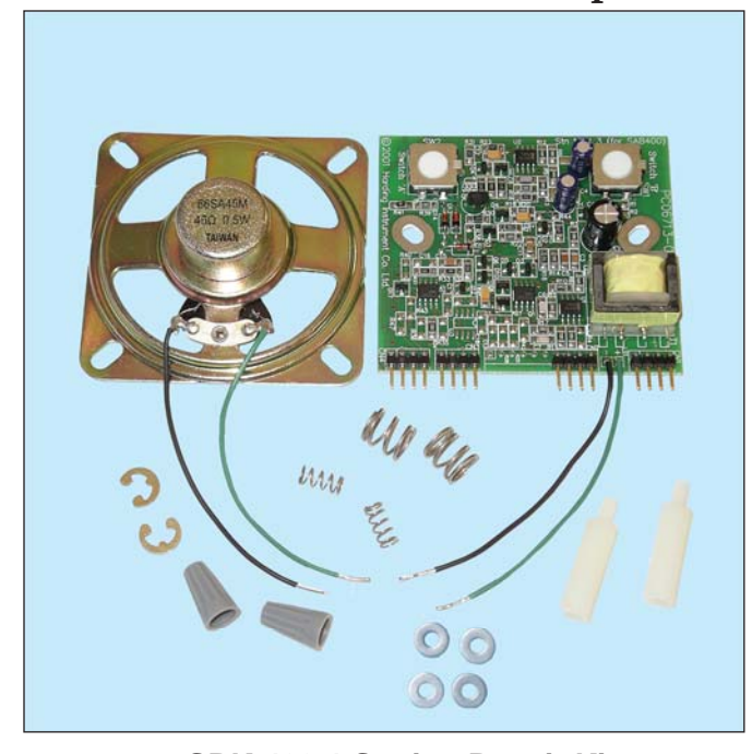
SRK-400-1 Station Repair Kit