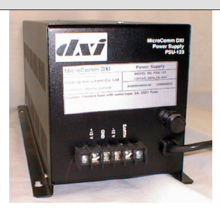
Fuse Location and Terminal Connections to PSU-123 (PSU-125)